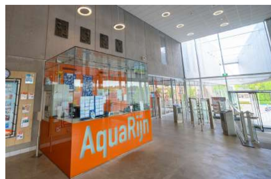
Guest service in swimming pool AquaRijn