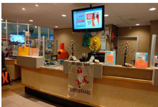
Guest service in swimming pool De Hoorn

The guest service desk is located at the entrance of both De Hoorn and AquaRijn swimming pools. Check the website for guest service opening hours. You can have a payment period added to your lesson pass by the guest service team.